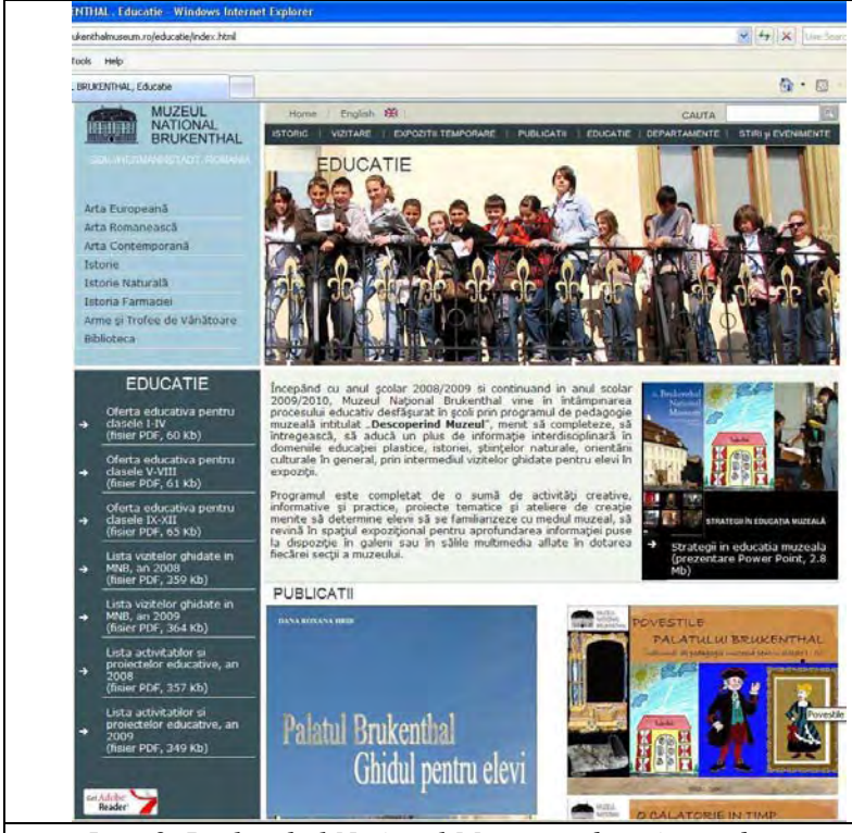
Img. 2. Brukenthal National Museum education web page