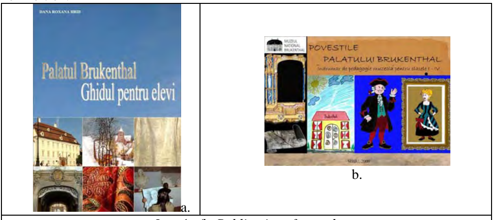
Img.4.a/b. Publications for students.

As far as we know, the Brukenthal National Museum is the first in Romania to publish a guide to the exhibition for students, the first to issue museum-applied activity books for children and the first to publish a catalogue on students' exhibition.