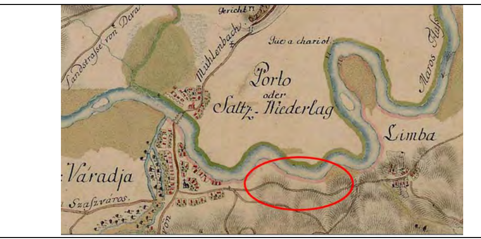
Map 1. Josephine map with archaeological site area.